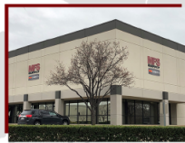
Texas Office, Warehouse, Showroom 1460 Avenue S Grand Prairie, TX 75050