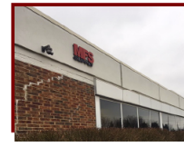
Cleveland, Ohio – Headquarters Office, Warehouse, Showroom 31100 Solon Rd, Solon, Ohio 44139