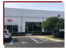
Atlanta Office, Warehouse, Showroom 1055 Research Center Dr. Atlanta, GA 30331